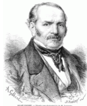
- Allan Kardec