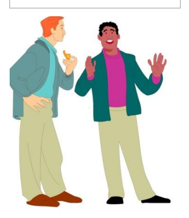
"Aid in your conversations. A good word always helps."